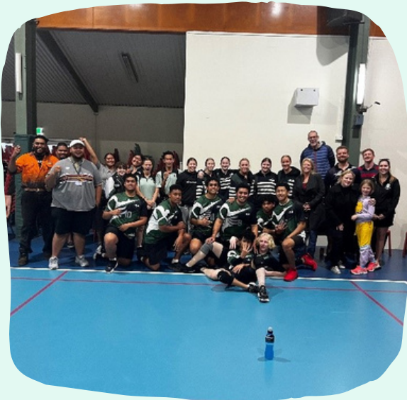
Open Boys Volleyball and their supporters. They finished equal first after the pool games and narrowly lost a playoff for 1st place!

Open Mixed Netball teams played at Limestone Park Netball Association. They finished 3rd and 5th out of 8 teams on the day.